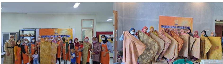
Figure 3. Evaluation and results of participants' Ecoprint products

The fourth session was focused on reflection and evaluation of the results of activities. The participants along with the community service team reviewed the eco-print product that had been produced, discussed its strengths and weaknesses, and identified improvement opportunities. This reflective discussion was also used to strengthen group work and formulate follow-up plans, including marketing opportunities for eco-print products around the area. Documentation of the product results and joint reflection was displayed in Figure 3.