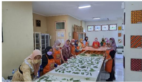
Figure 1. Participants taking part in the Ecoprint making training

the participants were given the opportunity to try out and assess their results. This process of training and co-practice is illustrated in Figure 1.