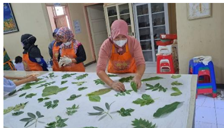
Figure 2. Participants in groups practicing making Ecoprints

The third session is the production stage mentoring, where the participants are starting the production of the eco-print fabric in groups with very little support from the extension team. At this stage, the participants are encouraged to make technical decisions independently, such as choosing the leaf combinations and steaming time control. The mentoring is done to make sure that the process is done according to the standard quality that has been agreed upon together. Figure 2 shows the production mentoring process and the participants' group work.